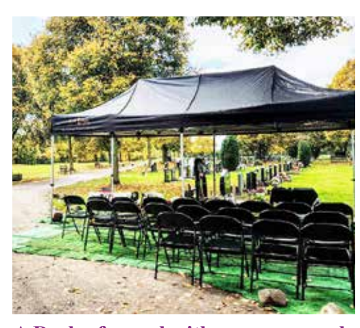
A Derby funeral with some unusual requests

Including a pink dove and Rosary bead balloons.