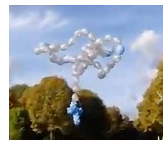
Rosary Bead balloons

No reasonable request denied! Doves now available in 24 colours.